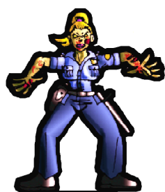
Zombie Cop 04

Figures and Coloring by: David Fernandez Catera ©2008