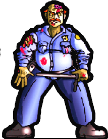
Zombie Cop 02