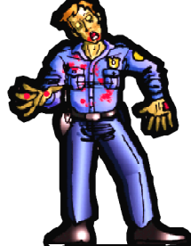
Zombie Cop 01