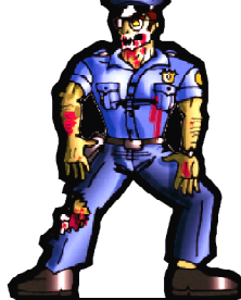
Zombie Cop 03